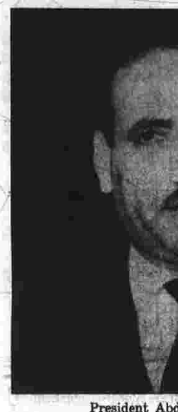
President Abdel Sarem Aref

ministers temporarily in a Cabinet reshuffle. There had been reports that Aref would be ousted. He had been provisional president since the military ousted Premier Abel Karim Kassem's dictatorship last February.