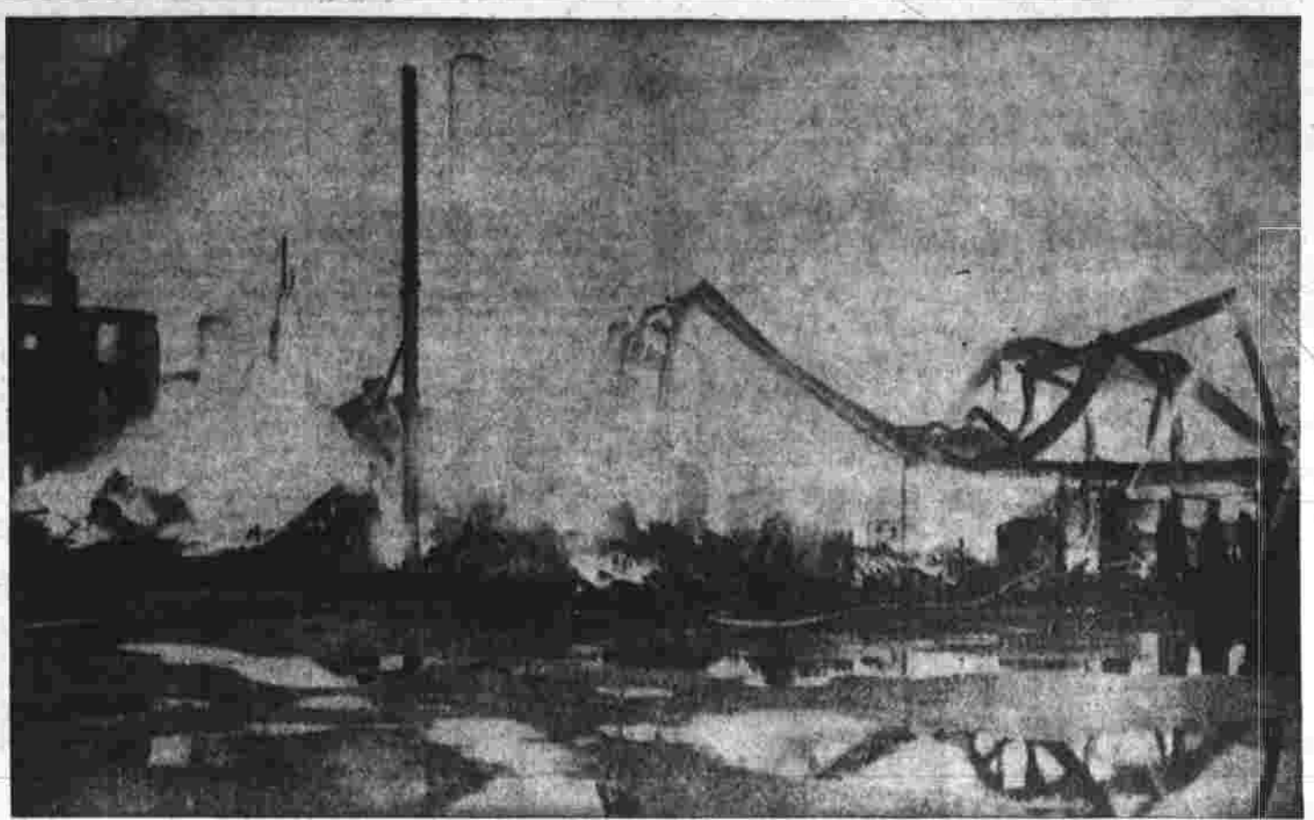
General view of the morning blaze just off the Atlantic City boardwalk. In the foreground is what is left of the Surfside Hotel. Twenty persons are still missing. Three were killed.

Looking toward the decades ahead, he said that "within our sight, if not yet within our grasp, is the day when men will routinely fly through space at 25 times the speed of sound."